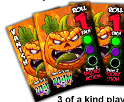
Spooky Action Dice manipulator cards

DICE MANIPULATION CARDS: These cards state that a die of one color can be changed to another color, thus helping you to win an important card. Also, there are cards that allow you to set one die to any color before your roll. These cards can strategically be saved for important times in the later stages of the game.