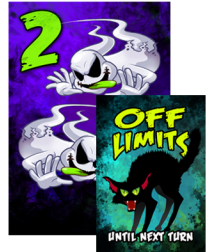
2 Ghost Card

Of course, your opponent may play one on you!